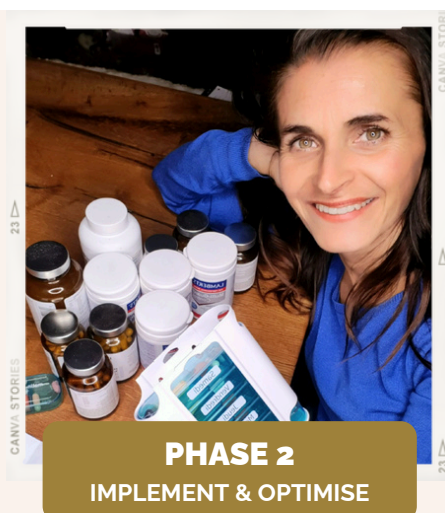
PHASE 2 IMPLEMENT & OPTIMISE